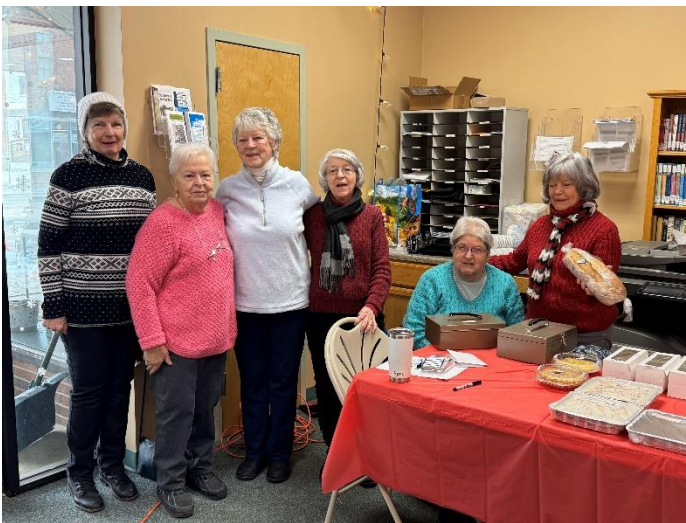
The women of Arcade UCC held a very successful bake sale during the Winterfest in the church library.

We are already looking ahead to next year’s Winterfest 2026 on Feb. 13-14! Mark your calendars!