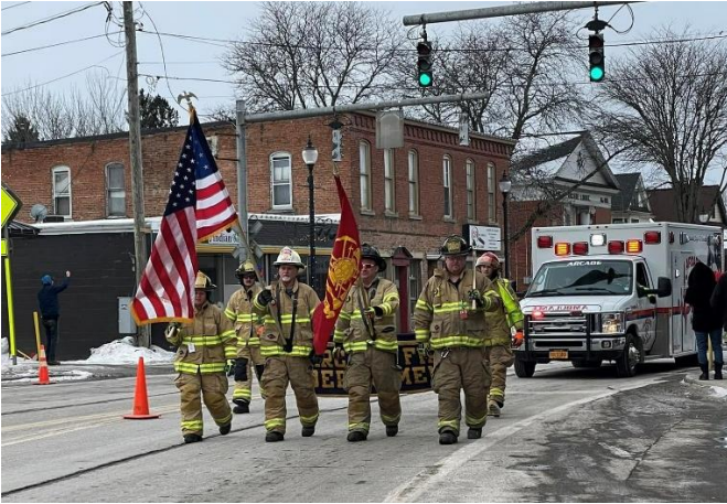
The Arcade Winterfest parade was viewed by many down Main Street.